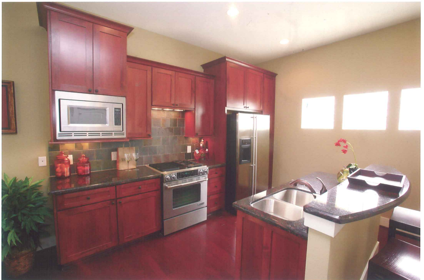
Standard Tricon Home amenities including gorgeous hardwood floors, sophisticated wrought iron railings, stainless steel appliances, stained wood cabinets and granite countertops are featured in this unique and open floor plan. This stunning model home is part of the Commerce Street development, located just minutes from downtown and Minute Maid Park.